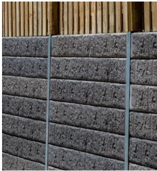
Sandstone Block -Storm Grey