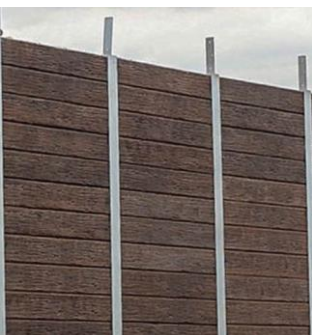
Premium Sealed - Mocha