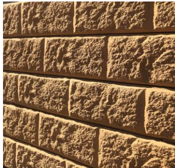
Sandstone Block - Paperbark