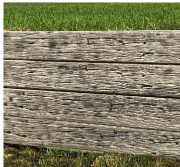
Premium Sealed - Country