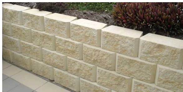
MORETON WALL BLOCK