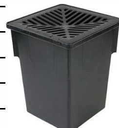
RAIN WATER PIT