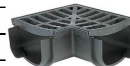
STORM DRAIN CNR BLK