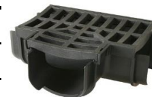
TEE PIECE WITH BLACK GRATE