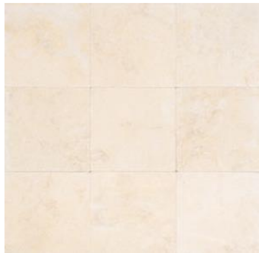
TERRE LIMESTONE TUMBLED