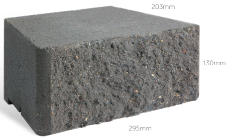
Windsor Stone 26 units per m 2

Maximum non reinforced height 1040mm + Cap (8 courses)